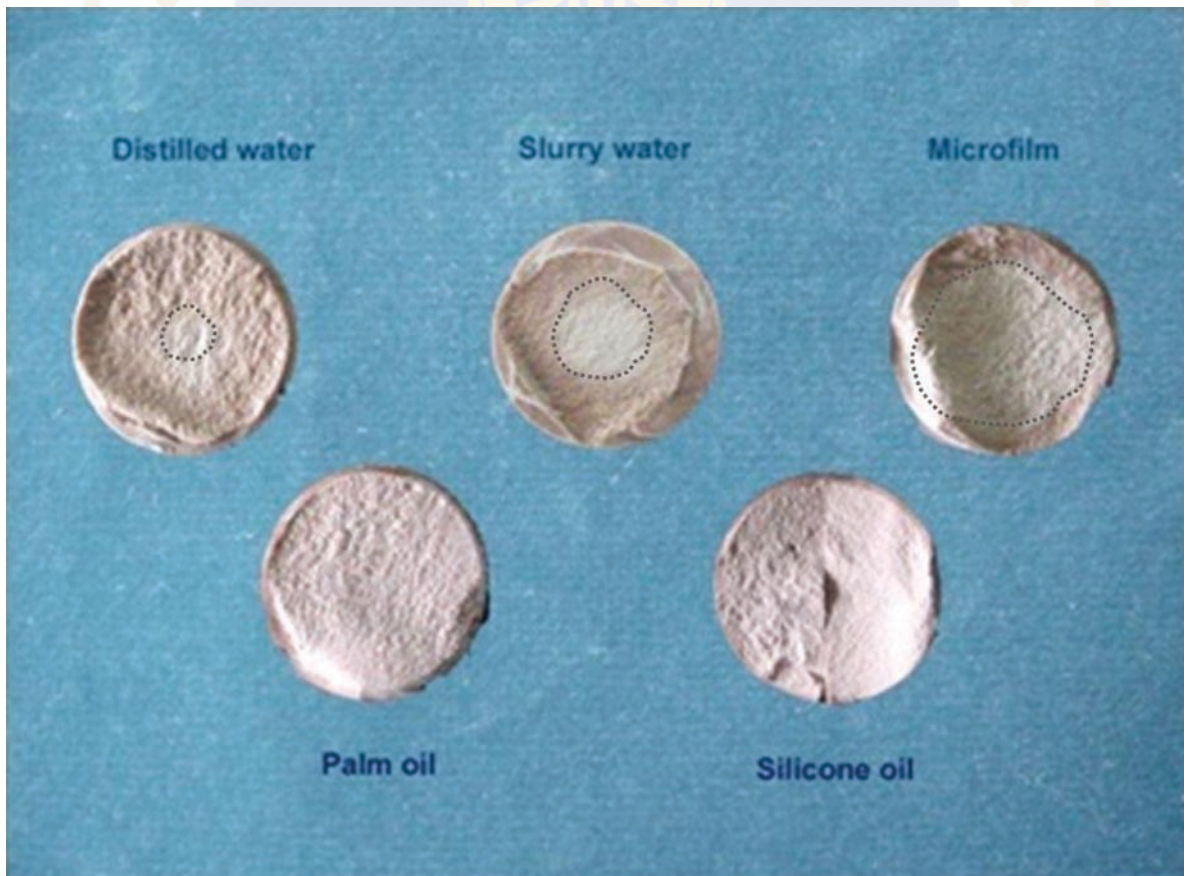
Fig. 2 The penetration of the liquid into the specimens. The dot line indicate the boundary of the diffusion of liquid into the center.

greater risk of developing a weak point to the die might occur. Regarding the surface hardness test, the authors agreed with Duke et al 8 that surface hardness was not a good measure of the abrasion performance of die stone. However, the validity of the surface hardness in this study helps us to gain more understanding on the effect of various liquids on the die stone. Therefore slurry water and water should be prohibited to use as a die lubricant at all time. It is possible that the silicone oil and palm oil in this study can be used as the die-wax pattern separator, or a lubricant as well as microfilm. However, due to higher viscosity of silicone oil and oily character left at the surface, this liquid should be used as an alternative only.