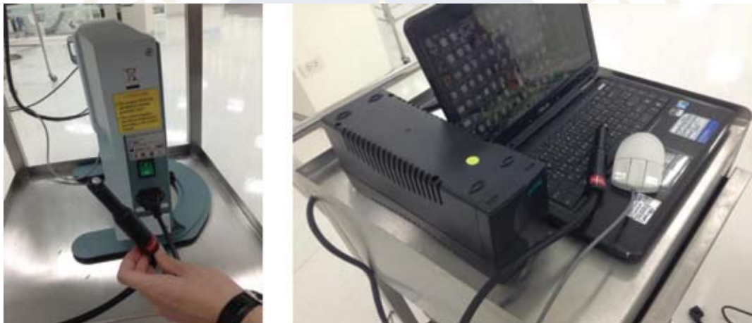
Figure 1 The intraoral pain assessment device for testing soft tissue numbness

4% articaine with 1:100,000 epinephrine. The insertion point of the needle was centered 1 cm above the mandibular occlusal plane. The syringe was approached from the opposite side of the mouth over the contralateral premolars (Figure 4). The mandibular tissue was pierced on the medial border of the mandibular ramus within the pterygomandibular space until the medial surface of the alveolar bone was contacted while being lateral to the pterygomandibular fold and the sphenomandibular ligament. Following which, the injection was given.