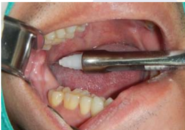
Right side of the patient on the upright position