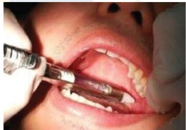
Left side of the patient on supine position